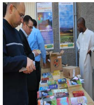
Picture from the Aberdeen mosque Open day.

ture could be seen gently listening to the words of the presenters and absorbed the messages on the posters. Many eagerly watched the muslims in deep conversation with their Creator during the mid-afternoon prayer. The Imam (Muslimminister) there afterward prayed &